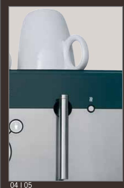
04 | 05